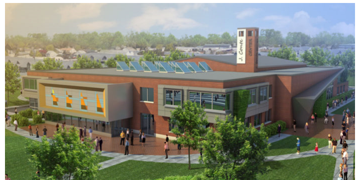
Artists Rendering of Planned James E. Conte Community Center

On August 7, the Town Board unanimously approved a