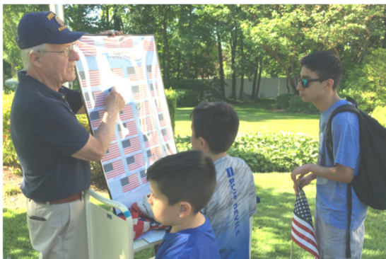
Flag Appreciation HHH Library, Melville, June 11