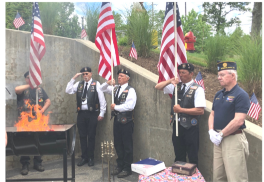
Covanta Flag Day Ceremony June 14