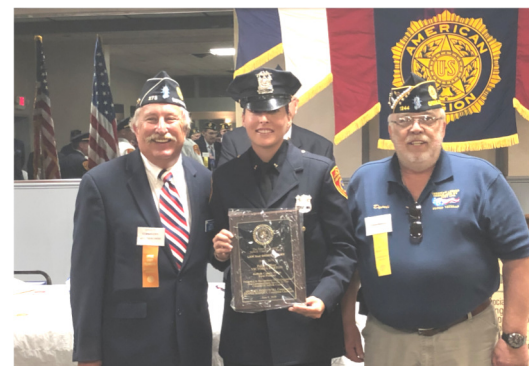
Law and Order Award SCAL Convention June 8