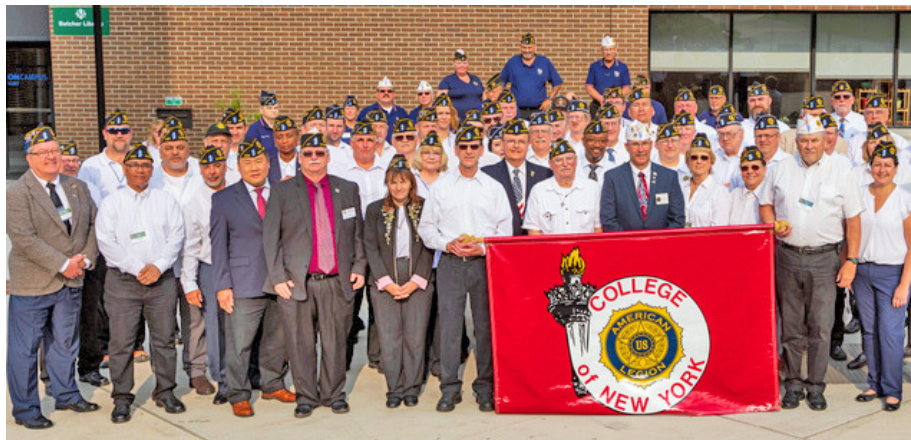
American Legion Family College Class of 2019

American Legion Family College of New York is a three-day immersion into the Legion's programs and structure, and issues facing the largest veterans' organization in the country.