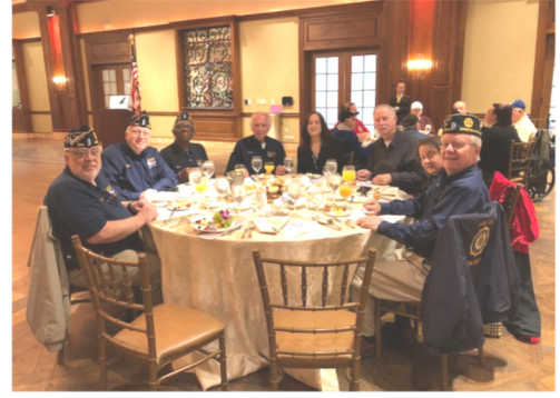
Suffolk County Vet Appr, Breakfast. May 6