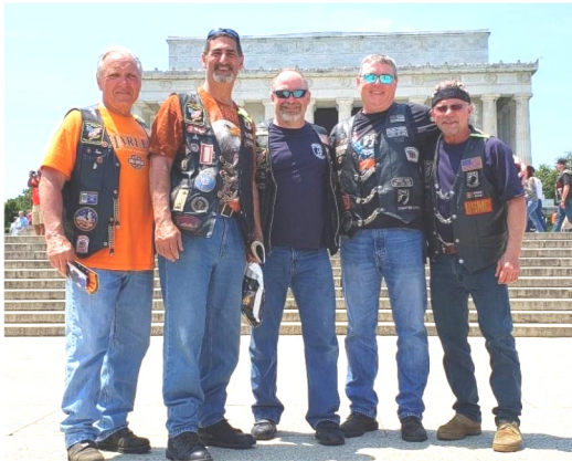
Legion Riders at Rolling Thunder May 24-27