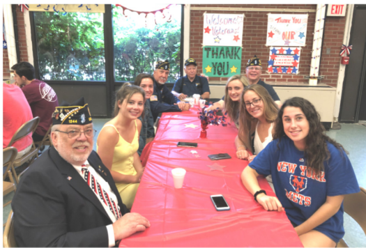
Harborfields HS Veterans Appreciation June 7