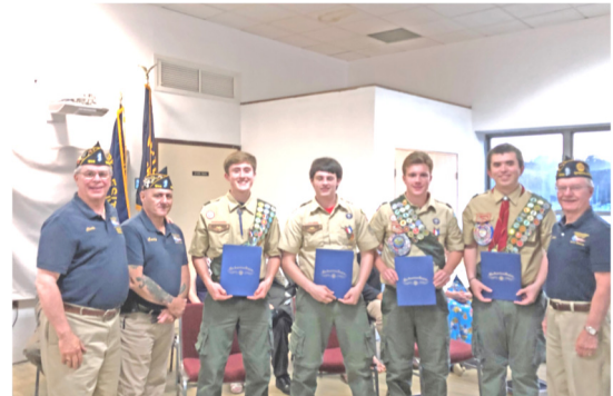
Eagle Scout Court of Honor Troop 78, June 21