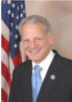
U.S. Representative Steve Israel 3 rd District, New York

Best wishes to American Legion Greenlawn Post 1244 Thank You for your Continued Service